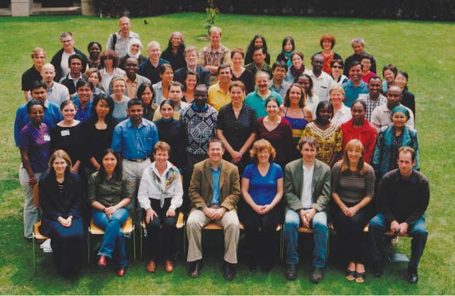
Refugee Studies Centre International Summer School in Forced Migration 2004