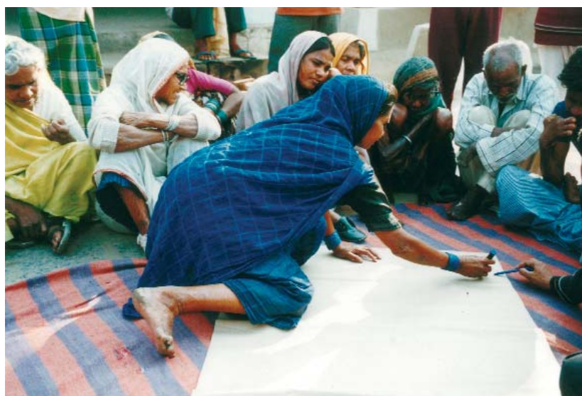
Leprosy-survivors map caste rules, central India