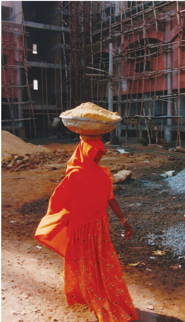
Construction worker, Delhi