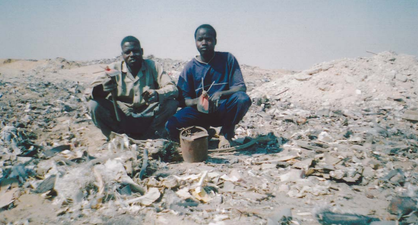
Darfurian refugees forage for saleable metal items in a refuse dump in Egypt