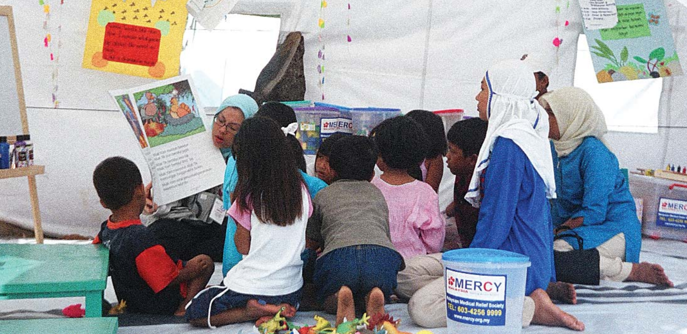
Nursery class in an IDP camp site, Banda Aceh