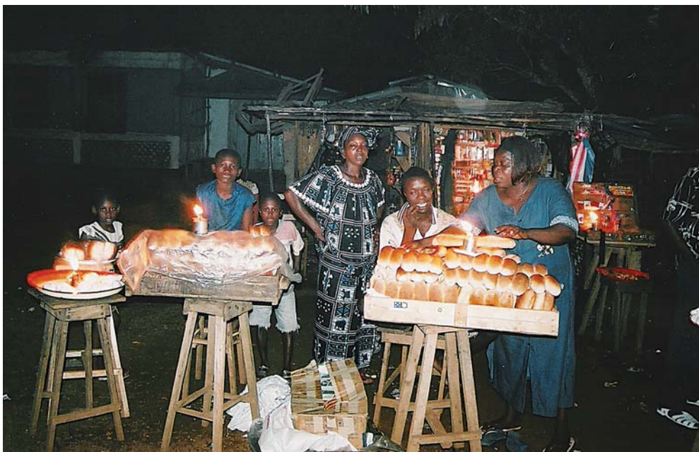
Bread sellers at night, Kambia Town, Sierra Leone

This research was part of a multi-country project sponsored by UNRISD, looking at the nature and management of ethnic plurality, particularly in the public sector. A main finding was that, although ethnic pluralism need not lead to ethnic conflict in the public sector of developing countries, in countries like Nigeria, that inscribed ethno-regional factors into the foundation of the state, such conflicts are virtually unavoidable. Although Nigeria has a long and creative record of struggling to cope with her dysfunctional heritage, some solutions quickly turn into the next manifestation of ethnic inequalities within the state.